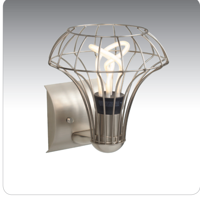
SPEZZA 7 SHOWN IN SATIN NICKEL WITH PLUMEN LAMP